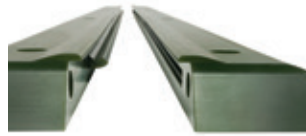
HP posts right/left 1250mm 70mm wide