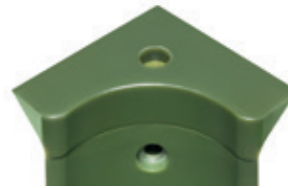
HP corner profile with protective cap 30/30/1200mm