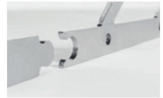
HP stainless steel suspension rail with holes